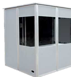
IR-32BOOT Interpreter's Booth