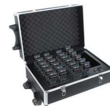
IR-32C Charging Box