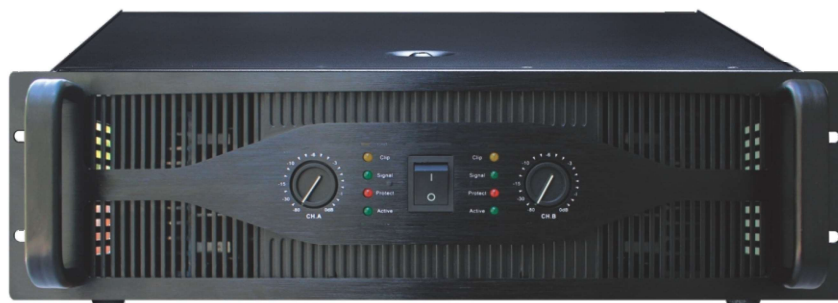
CH-1000 / CH-1200 / CH-1600