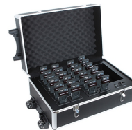
IR-24C Charging Box